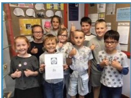
Our amazing Pupil Forum and "Grey for a Day"