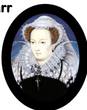
Mary, Queen of Scots