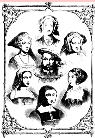
Henry VIII and his six wives