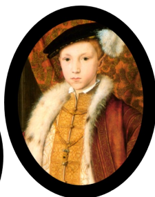
King Edward VI