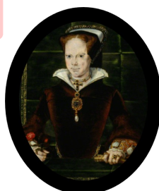
Queen Mary I