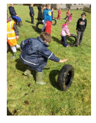
Outdoor Learning Day

As an ARB, we like to take part in as many whole school events as possible and will adapt access to suit your child. Some of the events we have accessed are: visiting shows, sponsored walks, outdoor learning days and school competitions. Some children attend the 'Open the Book' assembly each week.