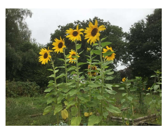
Class 7 sunflowers

Please take a look at our website pages for more information and photos. We are very happy to answer any questions you may have and we hope you will come and see us. We would be delighted to show you around.