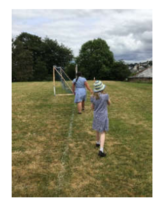
Sponsored Walk for Sarcoma