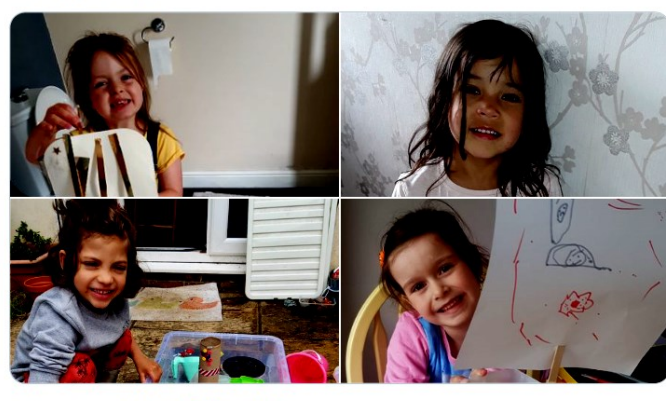
9:28 AM · Jun 9, 2020 · Twitter Web App

Year F showed great resilience in their home learning when making model boats and then seeing if they floated or not.