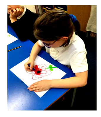
Once again "Thank you"