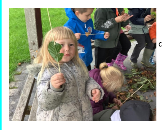
We discussed the different seasons, and about all the different colours of the leaves we collected during our session on this glorious autumnal day.

went on a leaf hunt. We were asked to find lots of different shape and colour leaves...which isn't hard to do on our beautiful field. Once we had collected lots of leaves, we had to choose a selection to make our own leaf skewers.