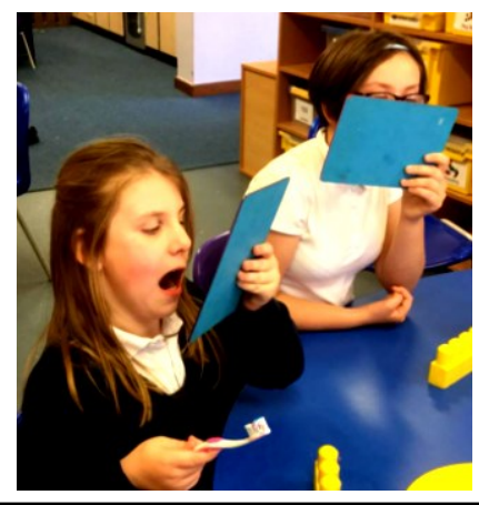
Finally, we had a go at cleaning our own teeth. There were lots of very sparkly clean teeth in class 7 this afternoon.

lego bricks! That was funny but it made us think about how much brushing we have to do.