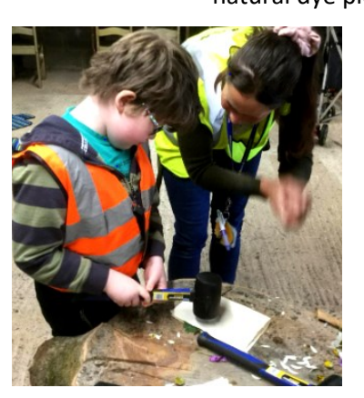
A great day was had by all.

We made a story stick, a woodland medallion and some printing with plants to create natural dye pictures.