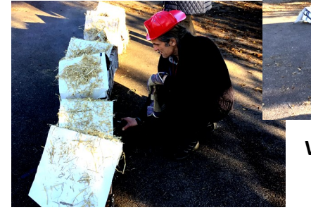
What a memorable experience for all!